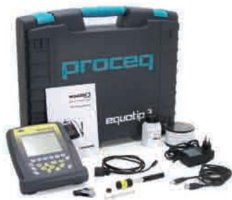
353 10 100 unit D

The Equotip3 (Part No 353 10 050) basic unit is combined with impact devices and test blocks to create an Equotip3 Hardness Tester unit that meets specific measuring requirements.