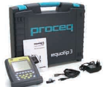
353 10 050 basic unit