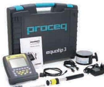
353 10 300 unit G